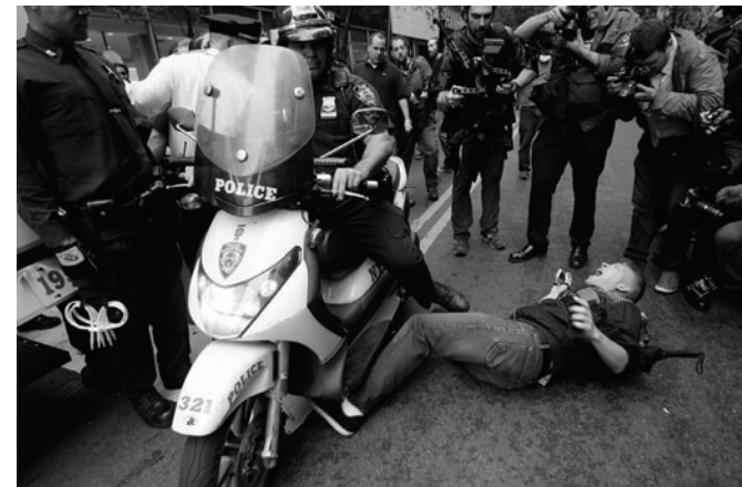
All the media coverage in the world won't help us if we fail to create a situation in which people feel entitled to defend themselves and each other.

Solnit may be right that the emphasis on nonviolence was essential to the initial success of Occupy Wall Street: people want some assurance that they're not going to have to leave their comfort zones, and that what they're doing will make sense to everyone else. But it often happens that the preconditions for a movement become limitations that it must transcend: Occupy Oakland remained vibrant after other occupations died down because it embraced a diversity of tactics, not despite this. Likewise, if we really want to transform our society, we can't remain forever within the narrow boundaries of what the authorities deem legitimate: we have to extend the range of what people feel entitled to do.